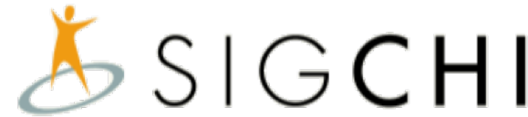
Figure 1: Insert a caption below each figure.